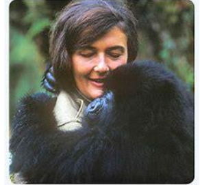
Dian Fossey with young gorilla.

It's going to be a great tournament with your help. Thanks for helping ACE, Gorilla Golf and the gorillas!