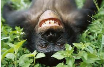
Bonobo is Happy Bingo's Back