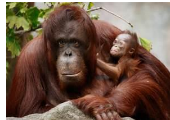
Bornean orangutan mom and baby

We would love to see photos of the houses decorated for Halloween and Christmas. Please send them to info@apeconservationeffort.org .