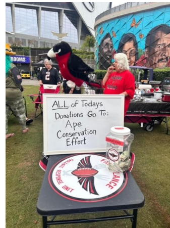
Collection jar for ACE donations at the tailgate

We tailgate in the Home Depot Backyard and we usually host guests from the opposing team. We usually have between 12-20 people. We always have a donation jar and decide on a charity to help.