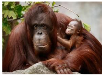
Bornean orangutan mom and baby

Special thanks goes to the G4R team for the clever idea. We hope that you have fun decorating your haunted Halloween house this month. Just think - you can now start planning how to decorate the house for Christmas. We would love to get photos of your houses decorated for both special occasions. Please send them to info@apeconservationeffort.org .