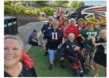
Some of the tailgaters donating to ACE

On Sunday, September 17, I was the lead for the tailgate, and of course I picked Ape Conservation Effort to receive the donations. A total of $425 was donated! I was very surprised, because we usually get around $150. The guests really stepped up to support ACE!