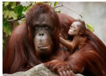
Bornean mom and baby

Let's briefly highlight the work and partners of Orangutan Outreach.