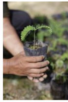
Planting trees to re-grow habitat

biodiversity and forestry research, and work to develop conservation solutions.