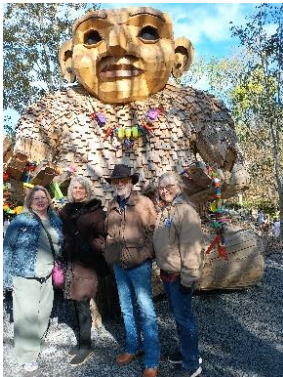
ACE members with the first Troll of Recycling