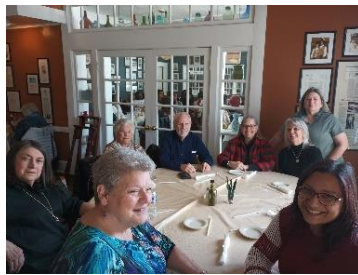
Ready for great lunch and conversation at Mary Mac's