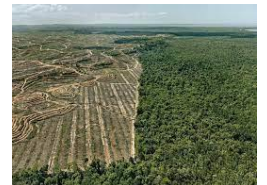
Before meets after clear cut forest in Borneo

Indonesia's success owes to a three-pronged and overlapping approach. Strict directives prohibiting wholesale forest clearance flowed from the top rungs of government starting about five years ago. Multinational consumer-product companies pledged to avoid palm oil that involved forest destruction, blacklisted forest-slashing plantations and traced their activities with satellites. And environmental nonprofits exposed murky supply chains that long made it hard to know whether palm oil came from a company that was clearing forest.