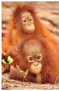
Orangutans watching you