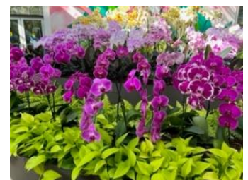
Orchids at ABG