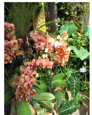
Beautiful orchids

in the corner was perfect for conversation. The food was good and we enjoyed being with our friends. Doggie bags were plenty as we left the restaurant. Since covid had made in person gatherings impossible, it was finally a great time to get together and enjoy friends, ACE, good food, trolls and orchids.